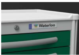
KEY LOCKING SYSTEM