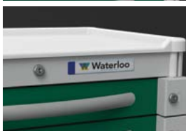
GATE LOCKING SYSTEM