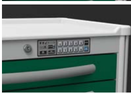
ELECTRONIC LOCKING SYSTEM (OPTIONAL WIFI AVAILABLE)