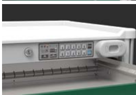
DUAL ACCESS CONTROLLED SUBSTANCE DRAWER