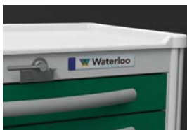
LEVER/BREAKAWAY LOCKING SYSTEM