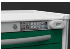
PROXIMITY LOCKING SYSTEM (OPTIONAL WIFI AVAILABLE)