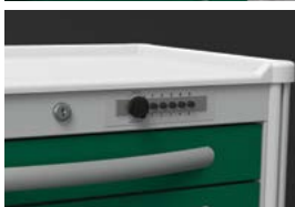
PUSH BUTTON COMBINATION LOCKING SYSTEM