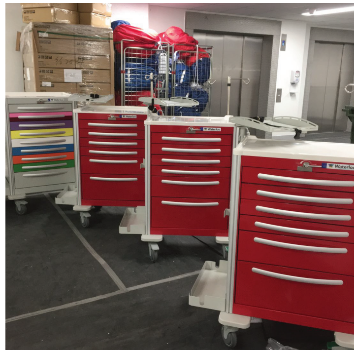
Waterloo Carts at Joan Kirner Women’s and Children’s Hospital

Waterloo Healthcare is proud to work with the best medical distributors in the industry. Our distributors support the medical professionals who use Waterloo Healthcare procedure carts in saving and enhancing lives. From helping customers determine which carts and accessories will best fit their needs to providing logistics and installation services, our distributor partners offer value-added services that help set Waterloo Healthcare apart from all the rest.